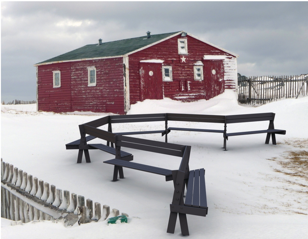
^ 3. furniture for Fogo Island