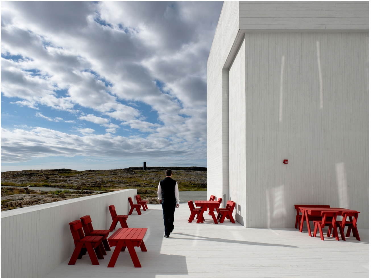
^ 2. furniture for the exterior of the Fogo Island Inn