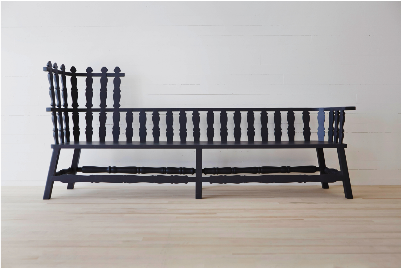
^ 1. furniture for the interior of the Fogo Island Inn