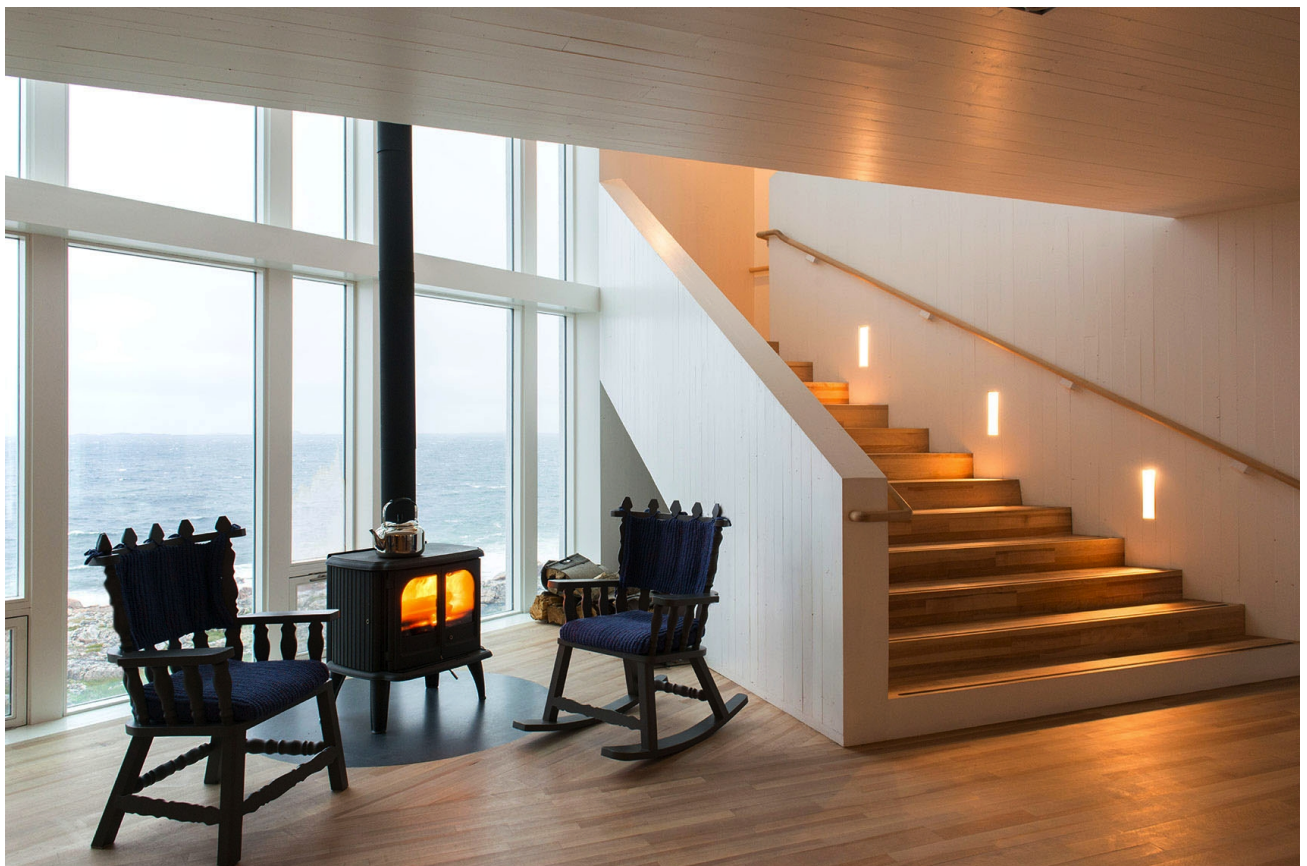
^ 1. furniture in lobby