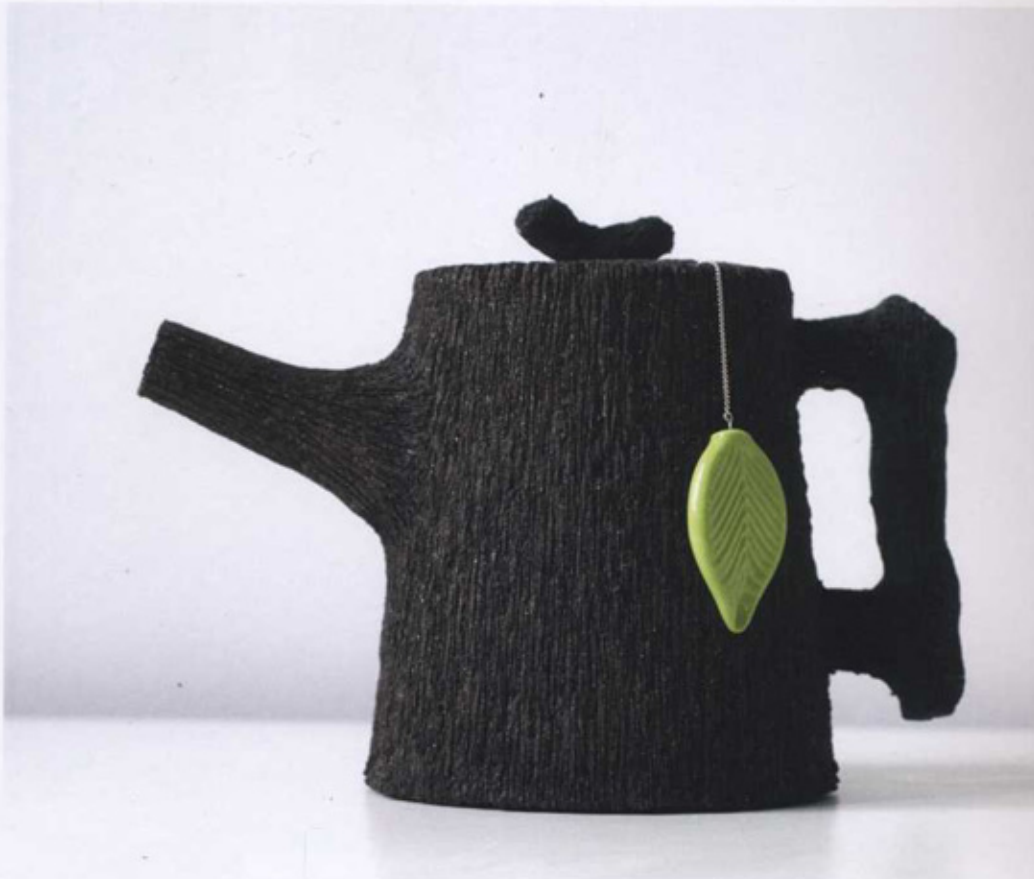
1 bottom Ineke Hans Forest for the Trees

Tea pot moulded and sculptured in wood pattern. The material is high fired stoneware. The tea container's leaf is made out of glass and the chain is made of sterling silver.